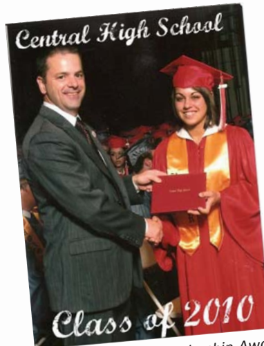
2010 - 2011 Student Scholarship Awardee